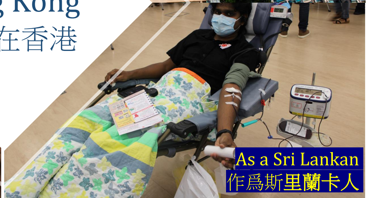
As a Sri Lankan 作為斯里蘭卡人