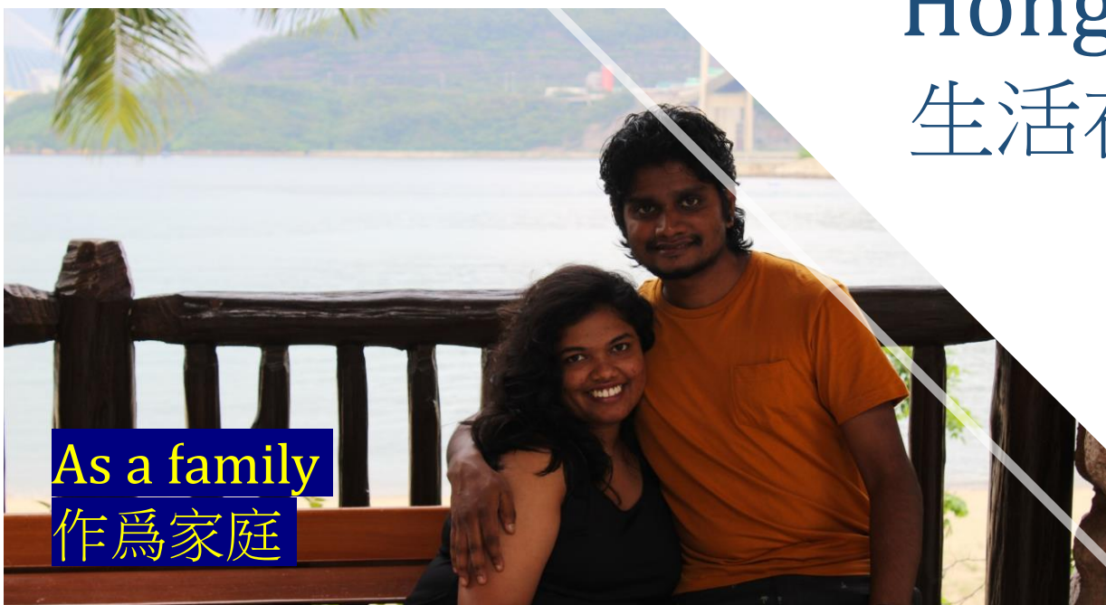
As a family 作為家庭