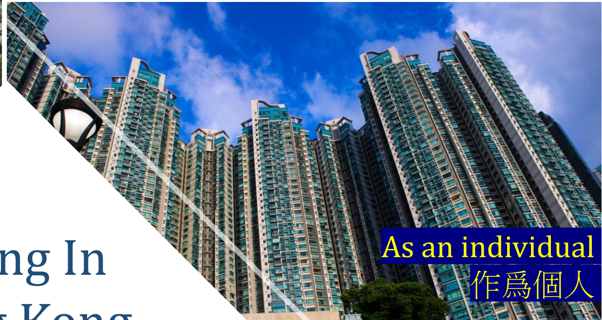
As an individual 作為個人