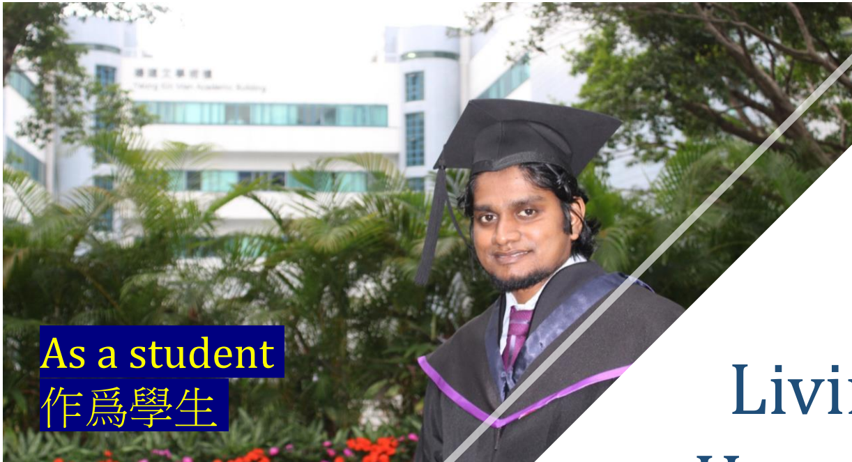
As a student 作為學生